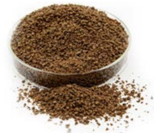
Chunks Irregular 'Parmesan'